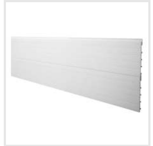
PERLINA PER RIVESTIMENTO MURALE