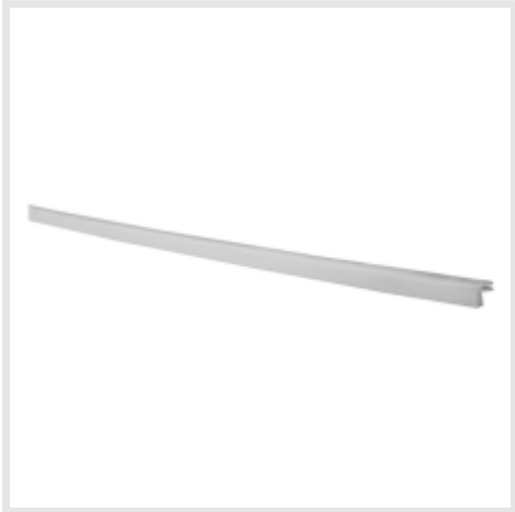
ANGOLARE INTERNO ED ESTERNO